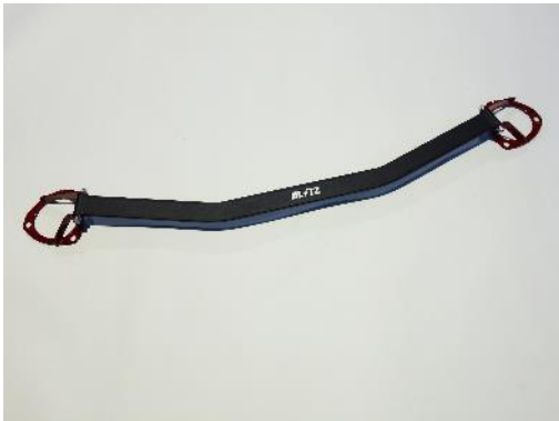
Honda Civic Front