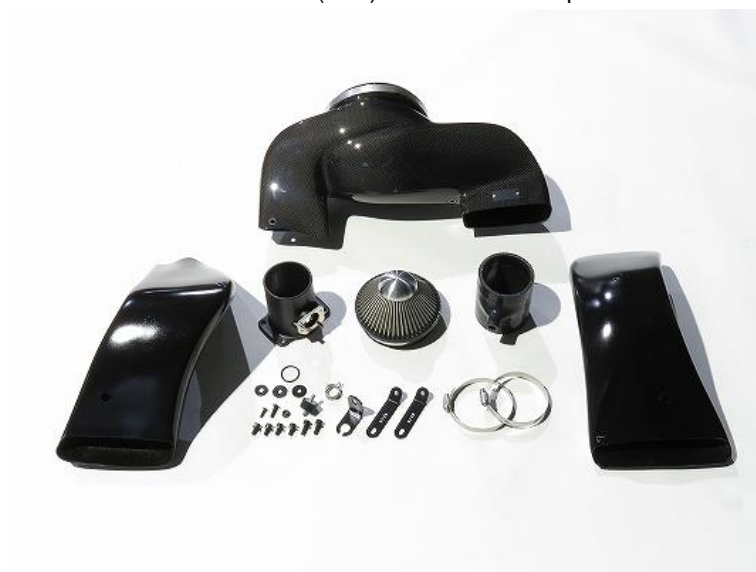
GR86/BRZ(ZN8/ZD8) CARBON INTAKE SYSTEM