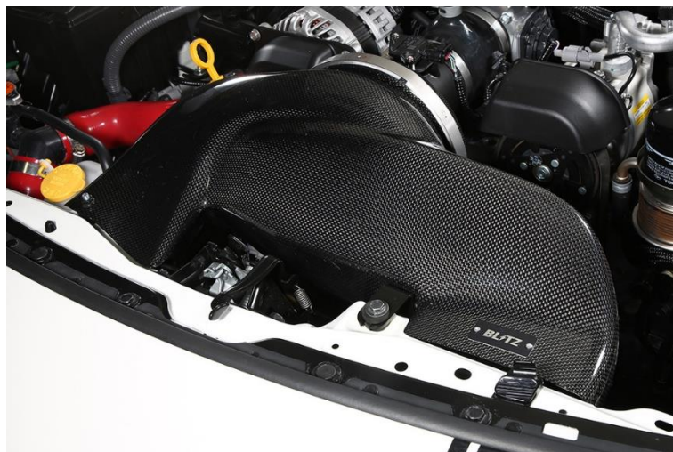
TOYOTA GR86(ZN8) Installation Example

Click here for further information on CARBON INTAKE SYSTEM