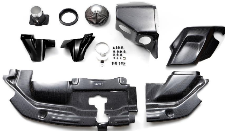
TOYOTA PRIUS (MXWH60/MXWH65)用 CARBON INTAKE SYSTEM