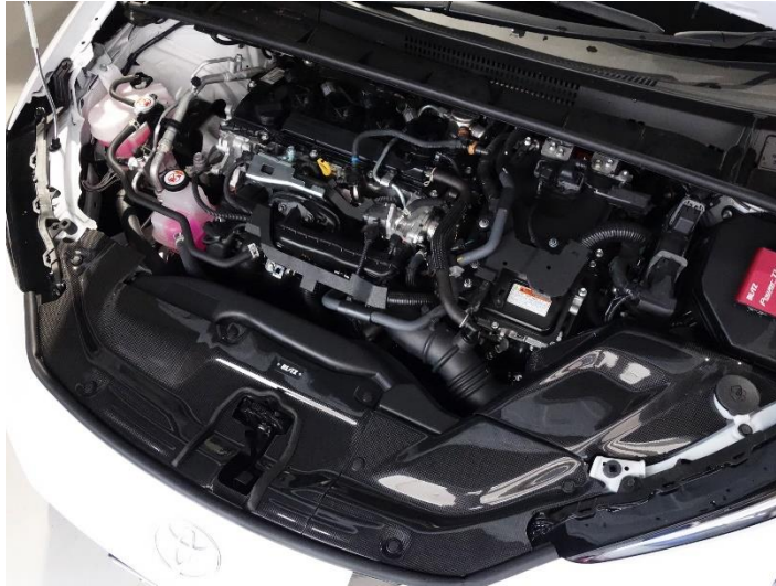
TOYOTA PRIUS (MXWH65) Installation Example

Click here for further information on CARBON INTAKE SYSTEM