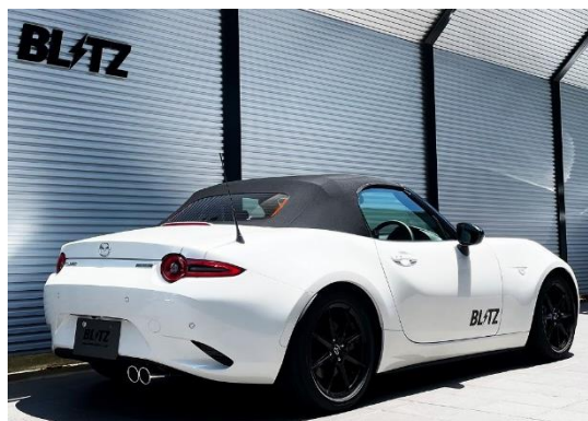
NUR-SPEC VS / Stainless Tail

The NUR-SPEC exhaust system shines elegantly due to the mirror surface finish and made from all stainless SUS304 to ensure high durability. The exhaust system is certified and tested to pass the Japanese vehicle regulation.