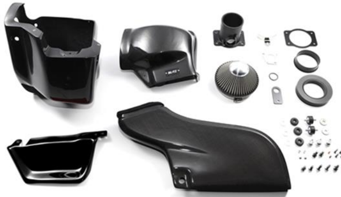
SUBARU WRX S4 (VBH) CARBON INTAKE SYSTEM