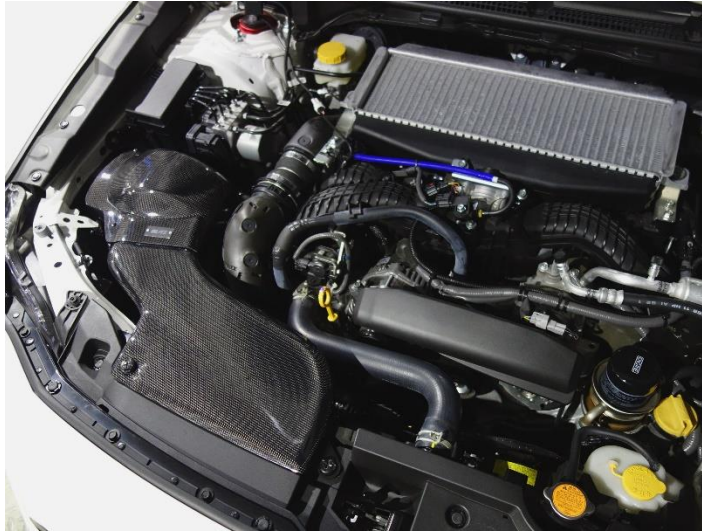
SUBARU WRX S4 (VBH) Installation Example

Click here for further information on CARBON INTAKE SYSTEM