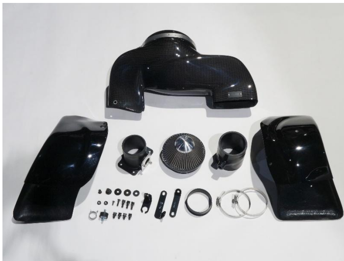
CARBON INTAKE SYSTEM