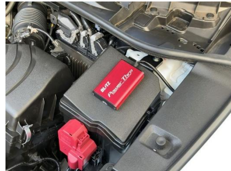
LEXUS LBX MORIZO RR