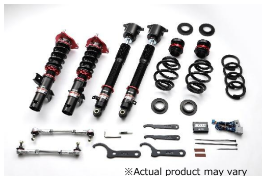
※Actual product may vary