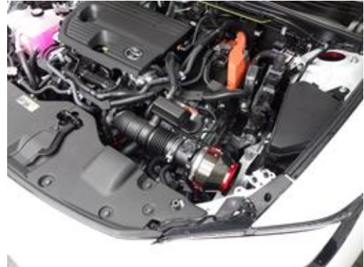
CROWN SPORT AZSH36W CARBON POWER Installatoin