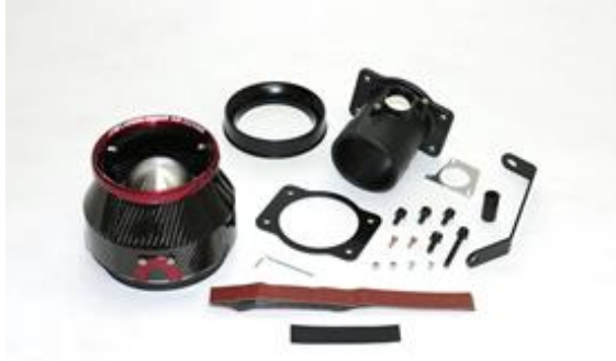
CROWN SPORT AZSH36W CARBON POWER