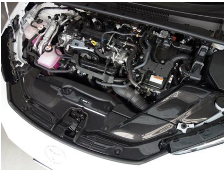
TOYOTA PRIUS PHEV (MXWH61) Installation Example

Click here for further information on CARBON INTAKE SYSTEM