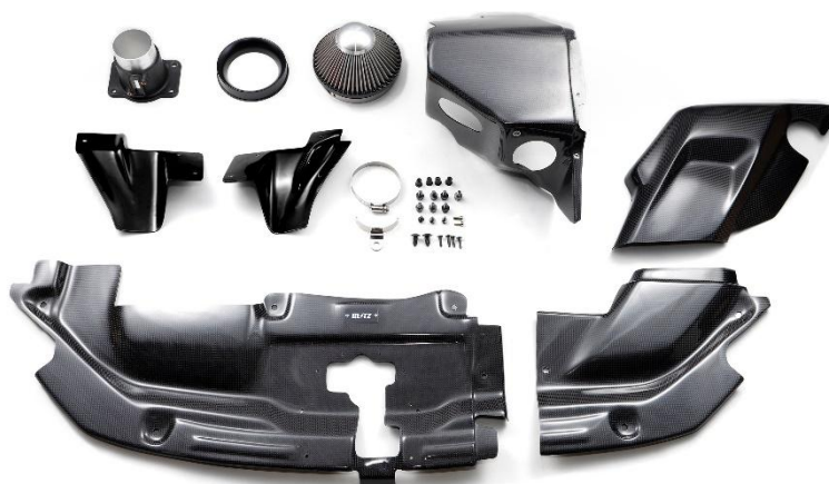
TOYOTA PRIUS PHEV (MXWH61) CARBON INTAKE SYSTEM